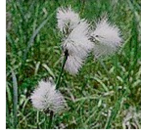
The plant badge, a means of clan identification, was worn on the hat. The Sutherland Plant Badge is Cotton Sedge.

The Motto - The motto of Clan Sutherland is "Sans Peur", which is French for "Without Fear".