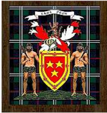
The Countess's Coat of Arms